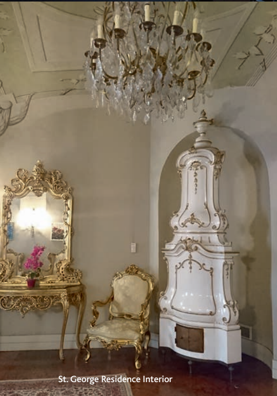
St. George Residence Interior