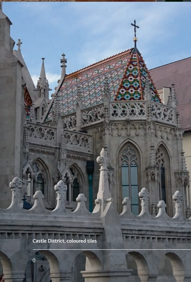
Castle District, coloured tiles