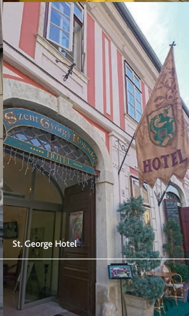
St. George Hotel